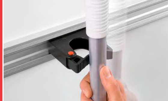
Hanging up and taking things down can be done using just one hand.