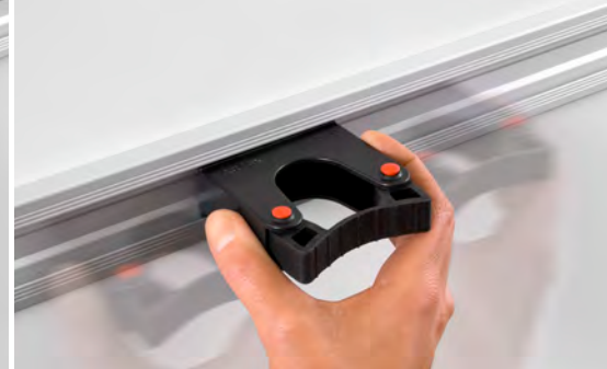
The holders can be easily adjusted sideways and the system can be expanded to the length you require.