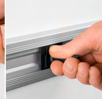
The Toolflex hook is inserted into the rail track and secured with a 'click'.