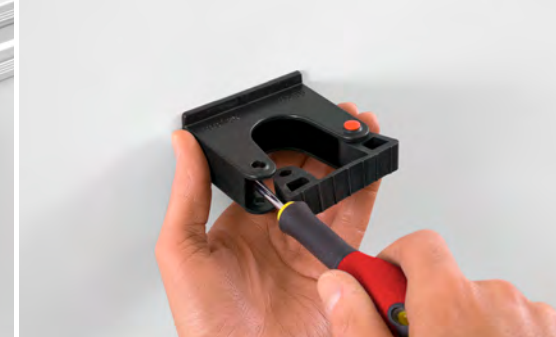
The holders have predrilled screw holes and can be mounted directly on a wall without a rail.